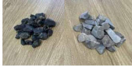
Ore sorting and DMS has produced 16-22% Cu DSO from 1.2-1.5% Cu mineralisation