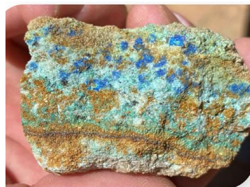
Extensive copper oxides outcrop in project area