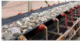
A low capital, ESG sensitive processing option has been confirmed at Storm